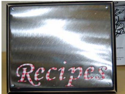
Recipe Stand—Magnetic Board $13.00