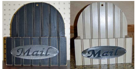
Mail Box $17.00