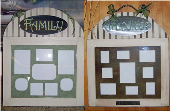
Grandkids or Family- Photo Frame $30.00