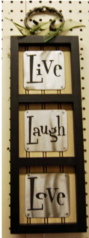
Live, Laugh, Love- Triple Frame $27.00