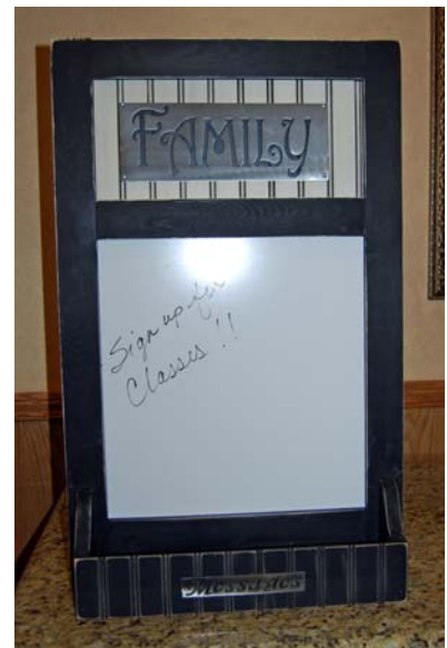
Family Message Board $25.00

Be sure to stop by the Arts and Craft Center at the Tooele Army Depot to see the projects for yourself!