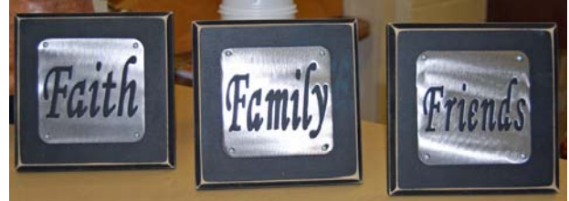
Faith, Family, Friends—Triple Stands $27.00