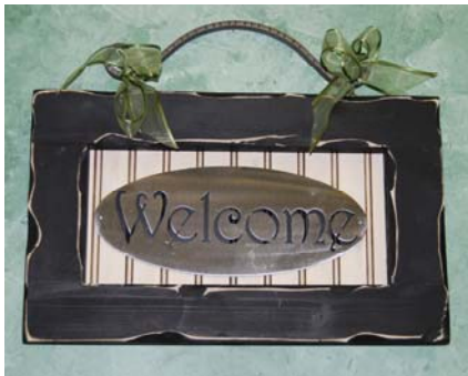
Welcome- Chunky Frame $25.00